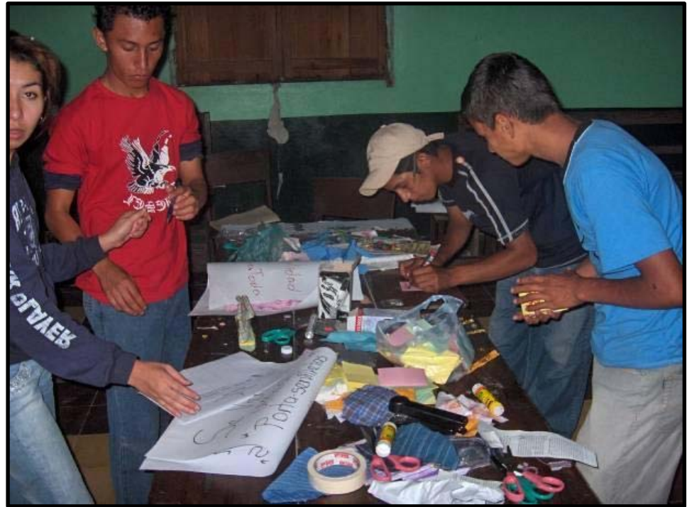
Youngsters in high social risk making an exercise of business training

This program supports the formation of business skills in the young people through a network of institutional partners (Consortio Jóvenes Emprendedores). The methodologies used in this project are based in the “learning by experience” approach. These methodologies take in account the particular life of every young participant on this program, therefore it guarantees good results.