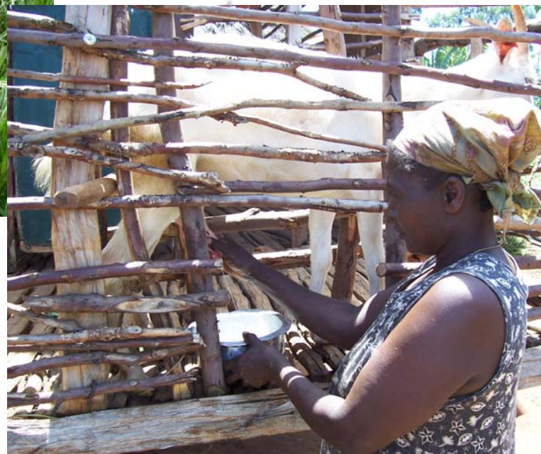
Goat farmer milking her goat