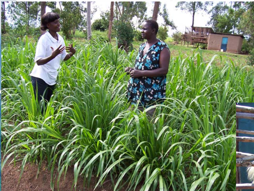
Project participant with Extension Officer on fodder production