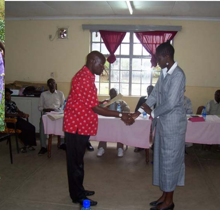
Community animal health assistant being presented certificate after training