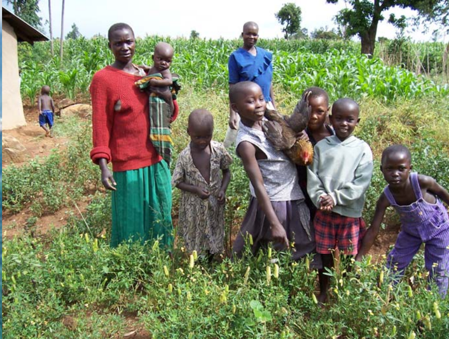
Project participant's family harvesting vegetables from their garden