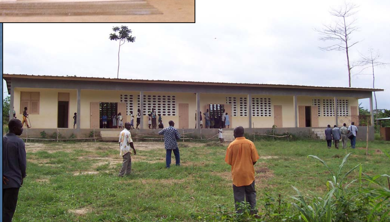
School built in Ehoueguié, Cote d'Ivoire