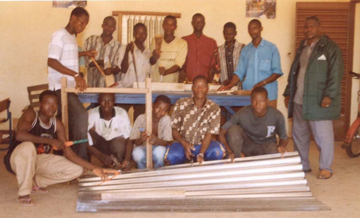
Vocational training in Sikasso. Mali